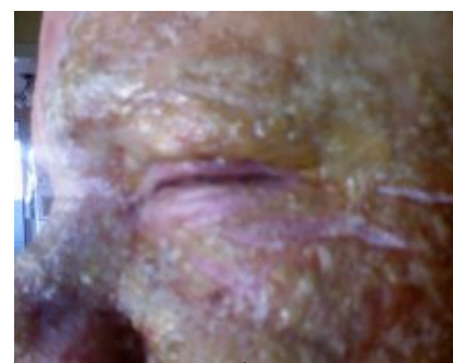
Dec 10<sup>th</sup>, 2009