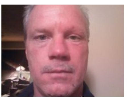
Before January 6<sup>th</sup>, 2010