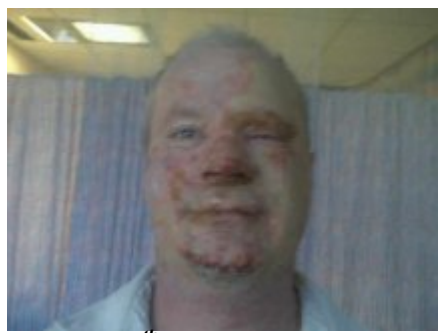
Dec 10<sup>th</sup>, 2009...leaving ER