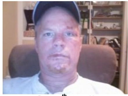
Dec 19<sup>th</sup>, 2009**