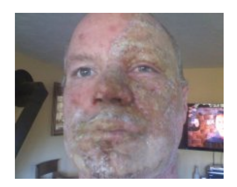
Dec 14th, 2009**