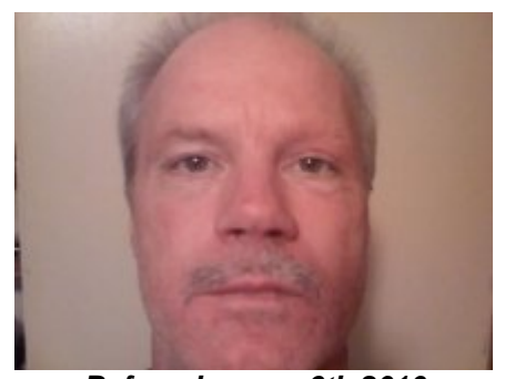
Before January 6th 2010